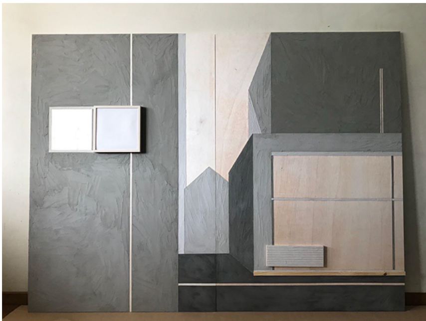
Kayleigh Goh, Replaying Days in the Lullaby I, 2018, Cement & Acrylic Paint on Wood, 200 x 150 x 5 cm

“And yet, if only” is artist Kayleigh Goh’s (b.1993) solo exhibition debut. Goh expands on a burgeoning visual practice begun in Lasalle College of the Arts, from which the artist graduated in 2016. Her works are rooted in the all-too-familiar disaffection of construction materials appropriated from the realm of functionality to create serene, balanced spaces of contemplation.